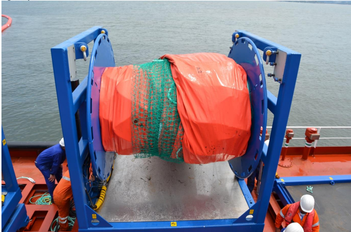
Fig.14 Hydraulic Boom Reel 10 m 3