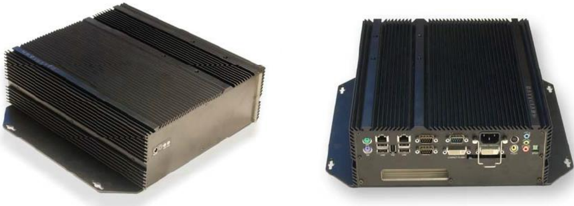
Fig.17 Miros Wavex Computer