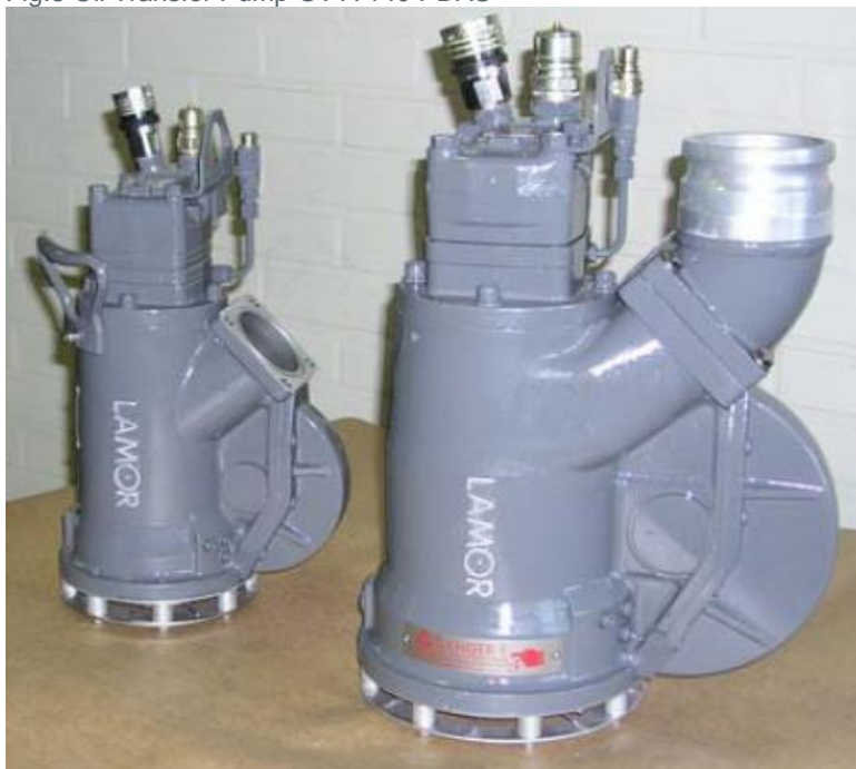
Fig.8 Oil Transfer Pump GT A 140 PDAS