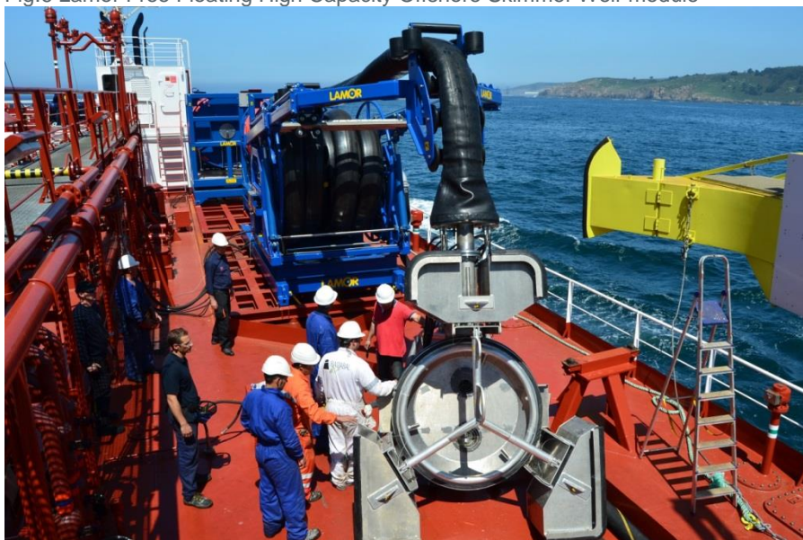
Fig.6 Lamor Free Floating High Capacity Offshore Skimmer Weir module