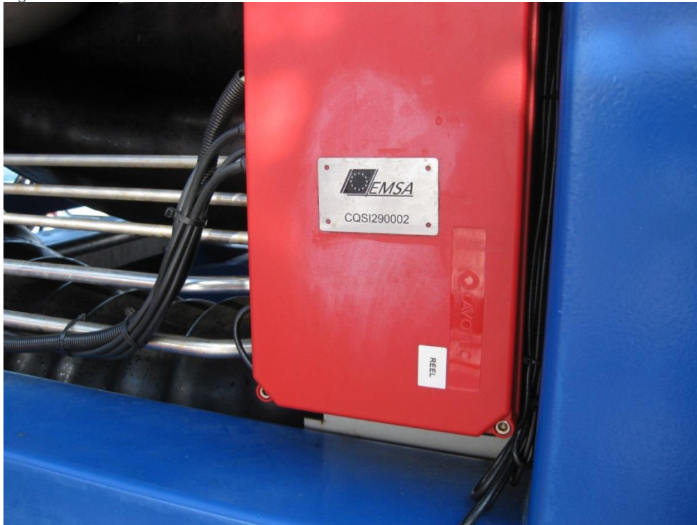
Fig.5 Radio Remote Receiver Box