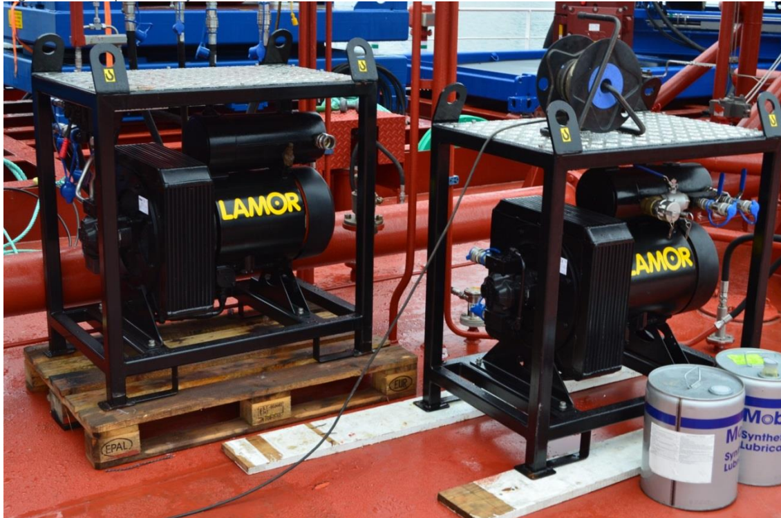
Fig.15 Air Compressor Hydraulic, HC 4100 with frame