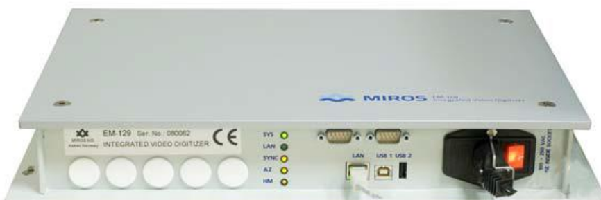
Fig.20. EM-129 Radar Video Digitizer

The Miros EM-129 Integrated Video Digitizer is designed for the Miros Wavex Wave Monitoring and Oil Spill Detection (OSD) systems. It comprises a radar interface board and a powerful radar image processing board.