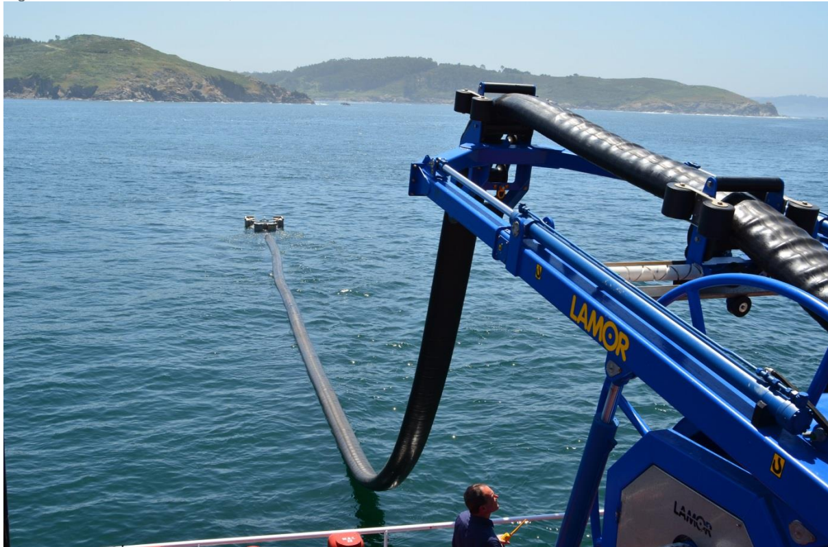
Fig.2 Umbilical Hose LUH 6 50, 90 Ch for LWS 1300 Mk II