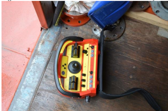
Fig.4 Radio Remote Control 3-5 for Skimmer Systems