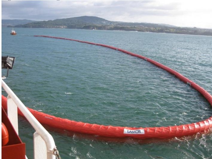
Fig.13 Lamor Single Point Inflation Offshore Oil Boom LSP 1900 – PVC segment