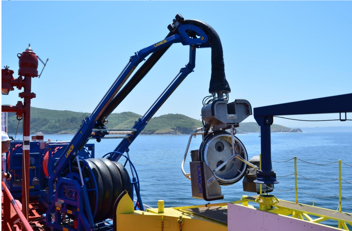
Fig.1 Umbilical Hose Reel LUT 90, with Telescopic Crane Arm