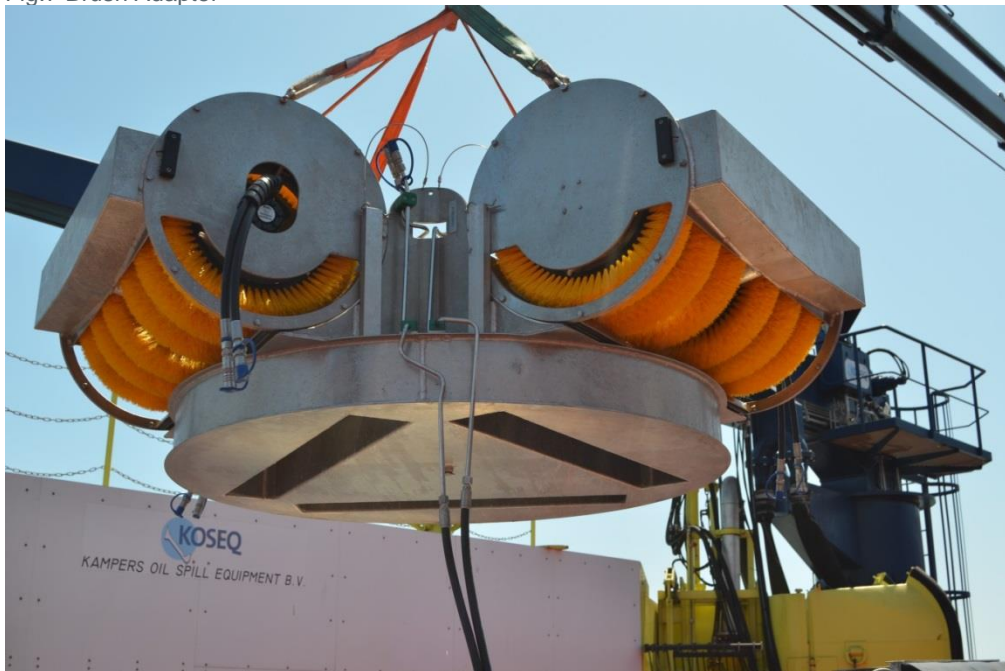
Fig.7 Brush Adapter