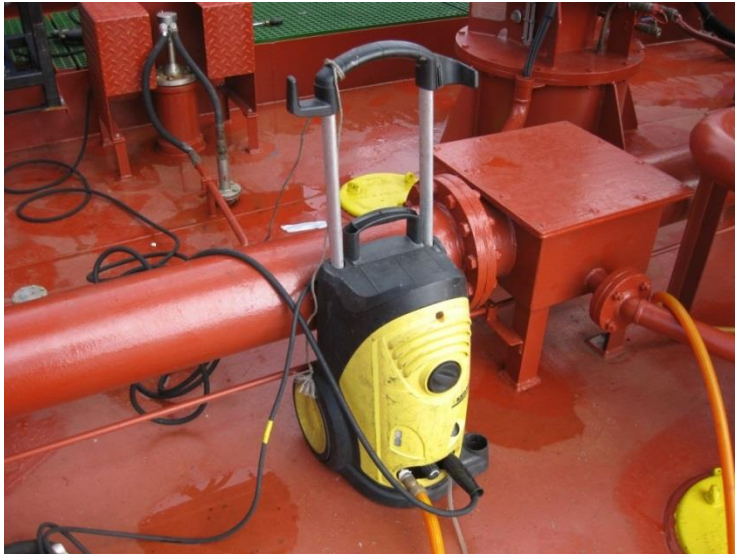
Fig.21 Portable claning machine