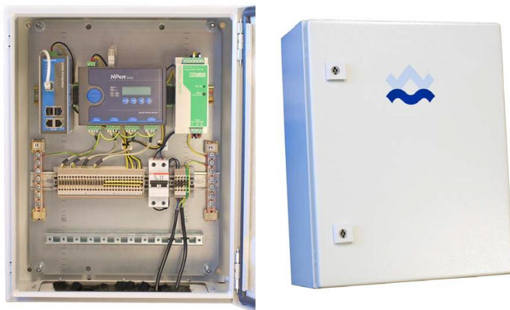
Fig.19 Radar interface Unit

The internal LAN switch is connected to the SM-135 Wavex Computer, the EM-129 Integrated Video Digitizer, as well as the internal serial line converter. The built in power supply may also power the optional Wind Sensor and GPS, if these are delivered as part of the Wavex delivery.