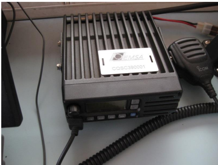
Fig.22 VHF aerial band