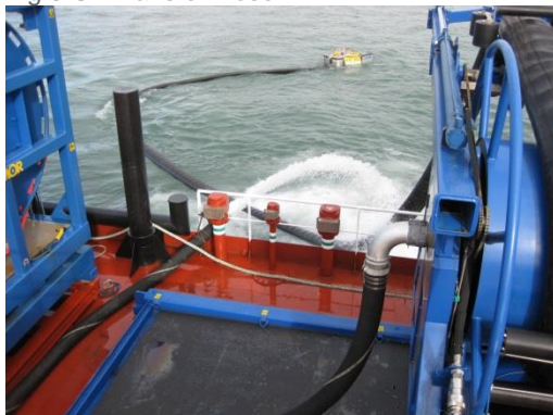
Fig.3 Oil Transfer Hose