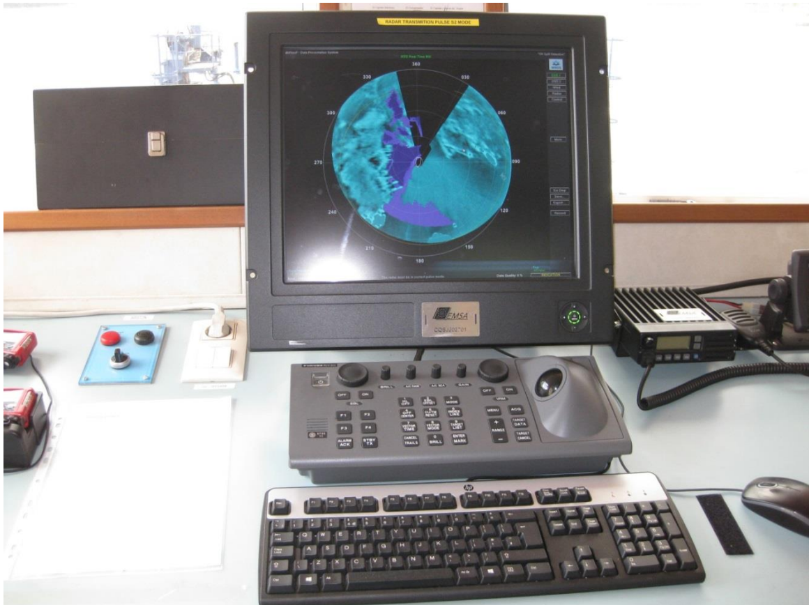
Fig.18 19" flat panel display with keyboard and tracker ball