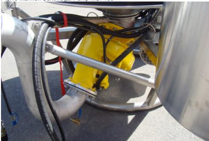
Fig.10 Mariflex Centrifugal Pump MSP150