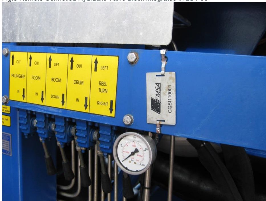
Fig.9 Remote Controlled Hydraulic Valve Block integrated in LUT 90